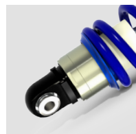
Rebound damping and Fast Rebound System (DetRa®)

NEW: Donerre proposes now in the Absolut the adjustment of its effective hydraulic bump stop. 5 very efficient positions easily adjustable by hand. The hydraulic bump stop in rebound allows the dampers ABSOLUT to substitute any kind of rebound strap, offering a better protection for the chassis. In addition, the angle of the reservoir is adjustable even when the damper is pressurized.