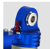
Hydraulic bump stop damping